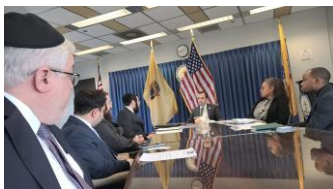
Meeting with Attorney General Matt Platkin